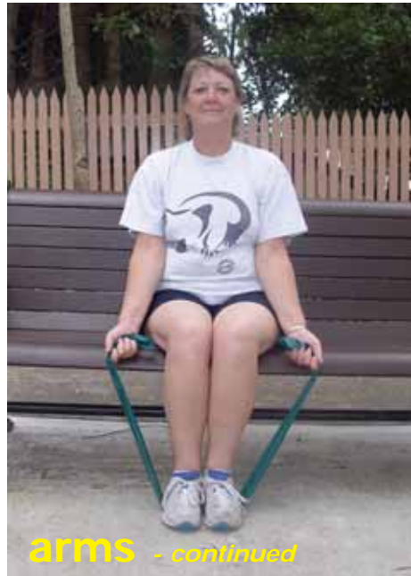
arms - continued