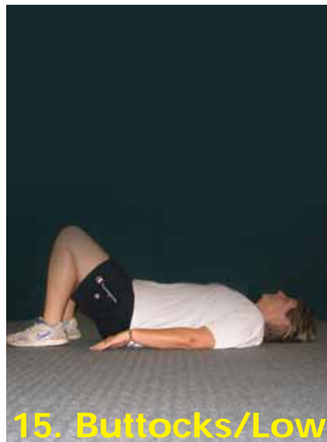
15. Buttocks/Lower Back