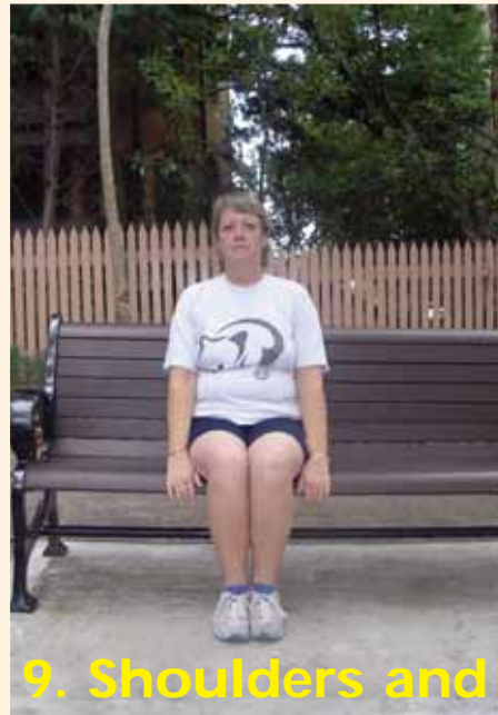
9. Shoulders and Chest