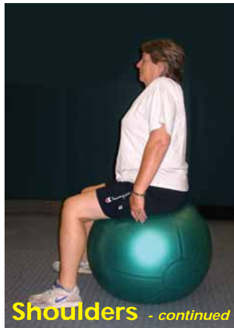
Shoulders - continued