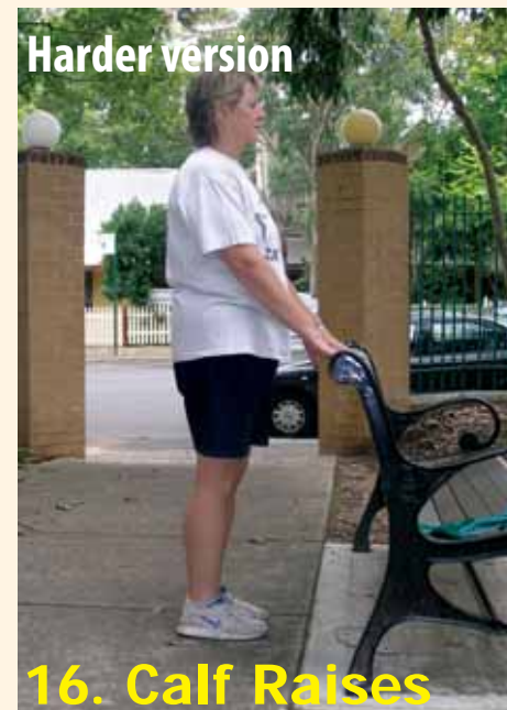
16. Calf Raises